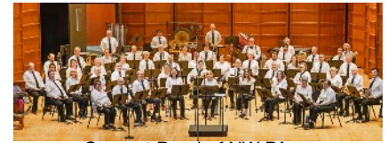
Concert Band of NW PA

July 5 "Pavilions, Picnics, and Parades" Ukuladies Gone Wild - warm-up music Concert Band of Northwest PA East End Fire Department Ice Cream Social