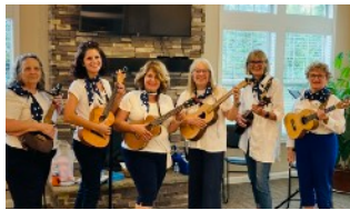
Ukuladies Gone Wild