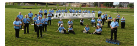
Youngstown Community Concert Band