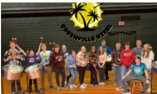
Greenville HS Steel Drum Band